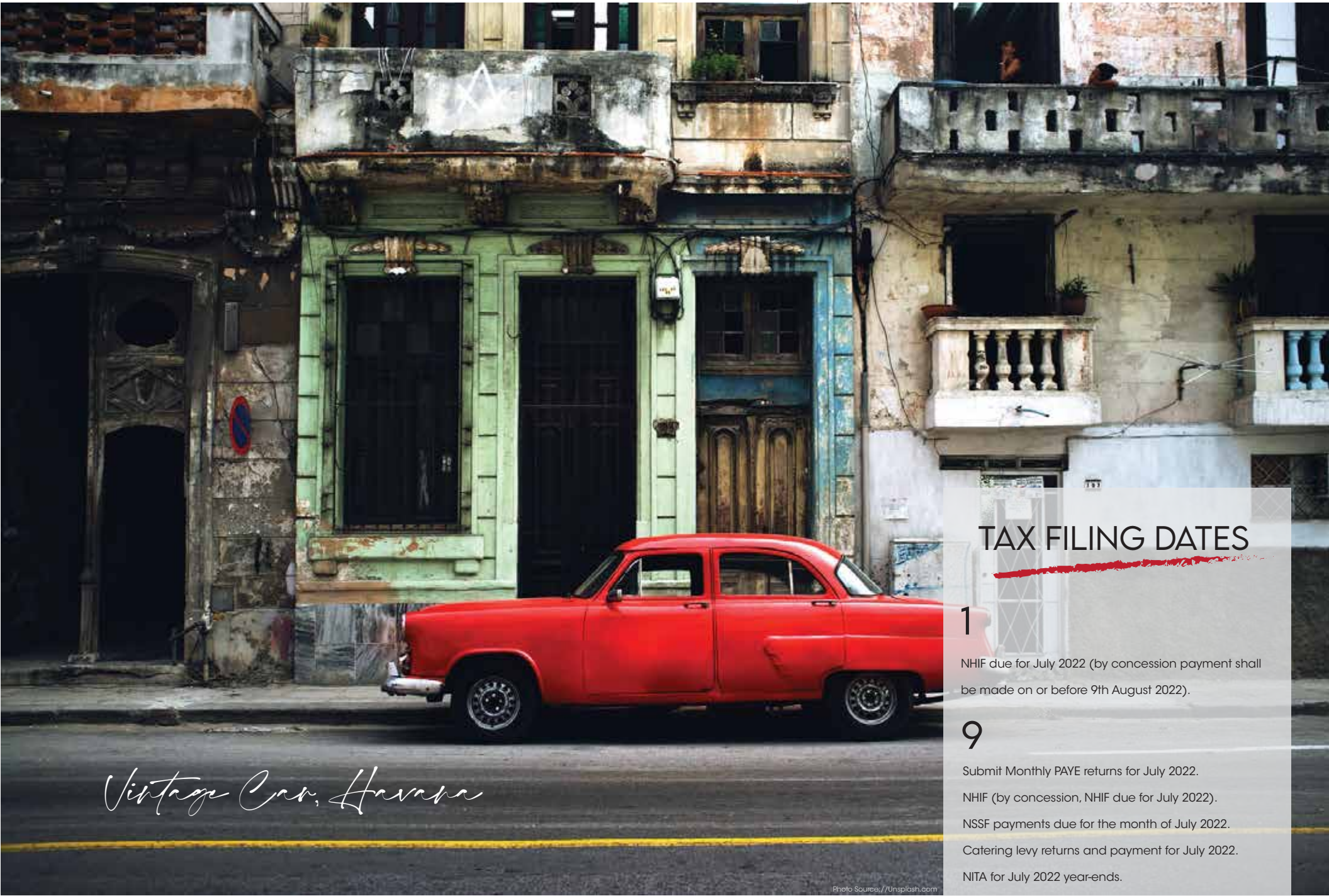
Vintage Car, Havana