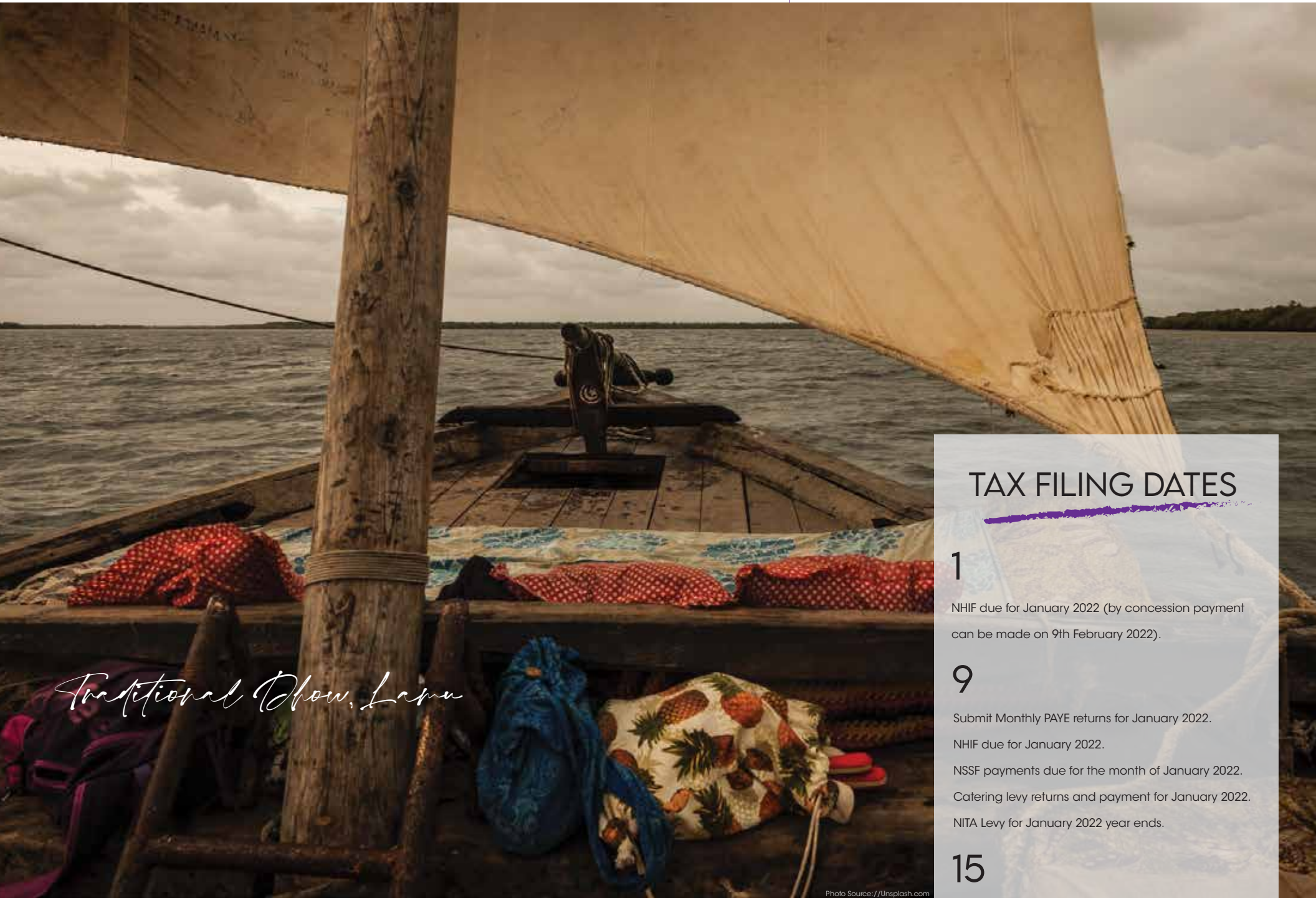
Traditional Dhow, Lamu